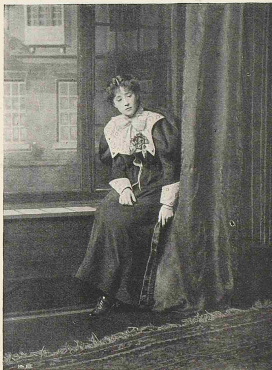
LADY MABEL (MISS NINA BOUCICAULT).