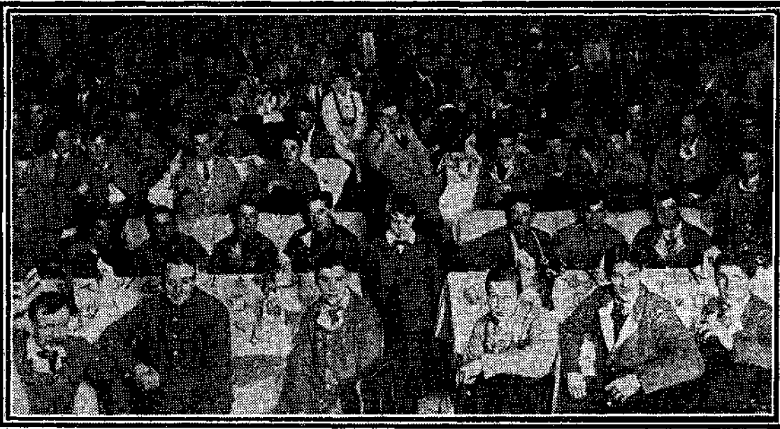
There was also tea and a concert. Here are some of the audience.