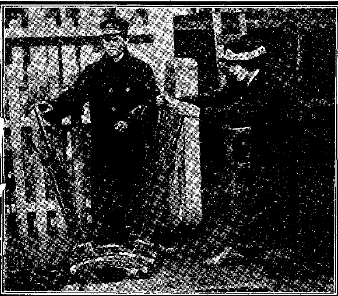
A young employee of the Great Eastern Railway, who was called up for service with the first groups, has been put back until March in order that he may teach his sister how to manage the levers at a level crossing. She will remain in the company's employ until her brother's return.