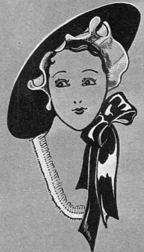
June, the charming star of "The Town Talks," wears this eighteenth-century bonnet as she alights from her sedan in the sketch entitled "The Trees in Bloomsbury Square." The brim is tilted, showing the frilled cap beneath, and the bow is of moiré ribbon